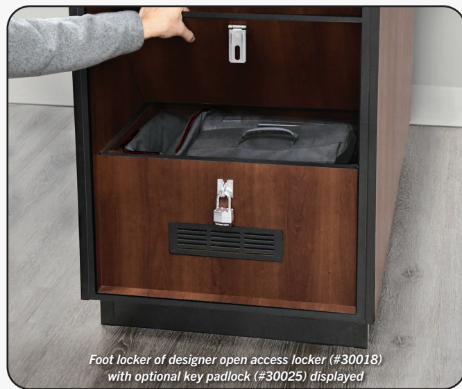
Foot locker of designer open access locker (#30018) with optional key padlock (#30025) displayed